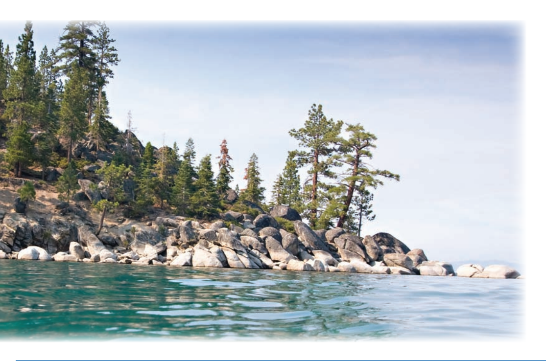
Lake Tahoe environmental news from 2012.

their introduction over 100 years ago (Lake Tahoe does not have a native species of crayfish.) The critters compete with native species for food, and their excrement causes algae growth.