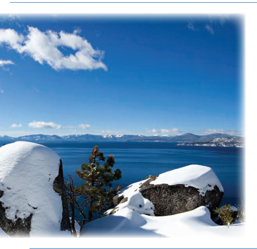
From our new Pipe Keepers program, to our social events series, 2012 was a year of exciting changes for the League.